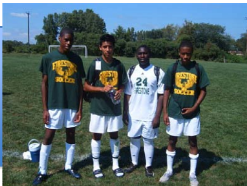
Firestone High School

In our 11 th consecutive year, AICSC has had the opportunity to watch many players grow from children to teenagers, and from teenagers to young adults. Our members grow into strong players and leaders on other teams in the community. We're always happy to see former players continue playing for local clubs and school teams including Firestone High School and Jennings Middle School.