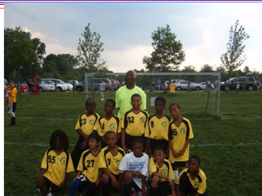
2 nd Annual Akron Unity Soccer Tournament Champions

Akron Inner City Soccer Club Alpha-Phi-Alpha Soccer Club American Solution Football Club Ashland United Soccer Club Cuyahoga Falls Soccer Club Green Soccer Association Highland Youth Soccer New Philadelphia Youth Soccer Association N.E.O. Soccer Club Norton Amateur Soccer Club Wadsworth Amateur Soccer Association Willard Soccer League