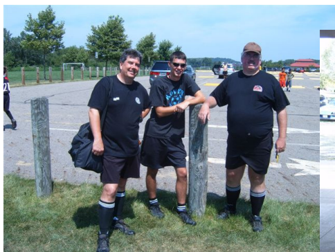
Referees at Inaugural Unity Cup Tournament