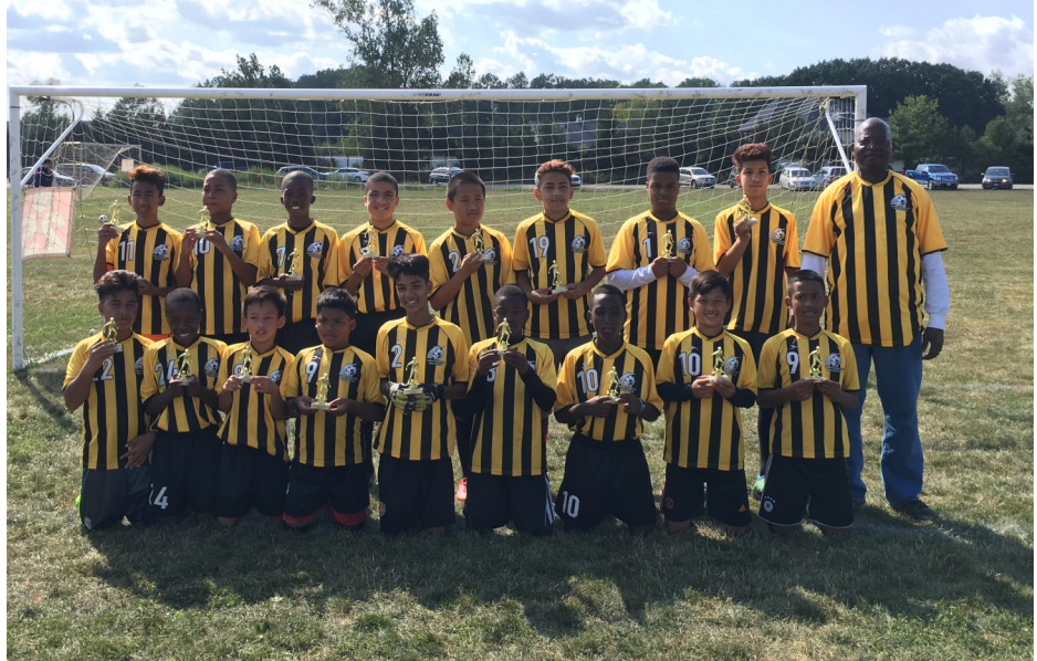
U12 - Akron Inner City Soccer Flames - Season Finale, | Lodi, Ohio