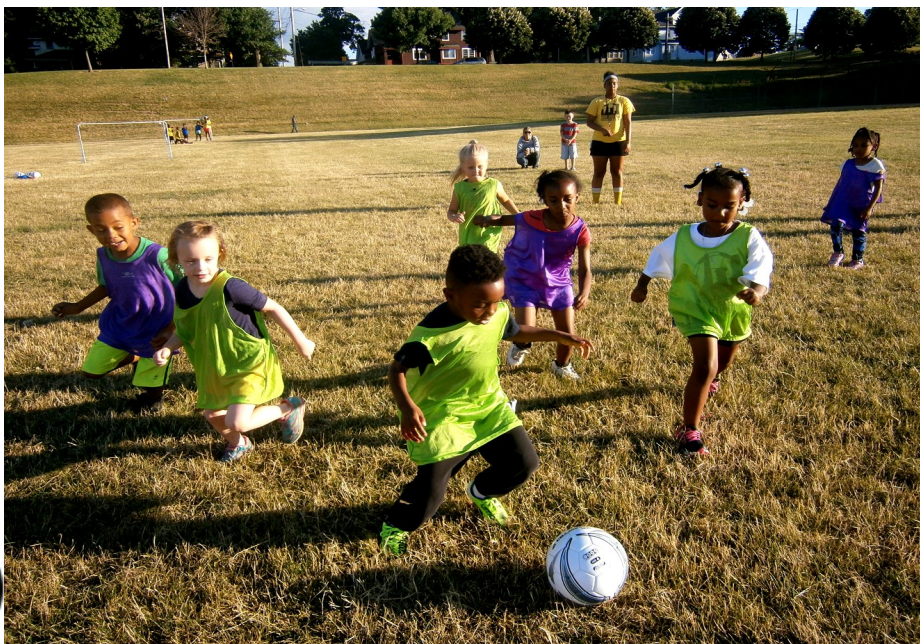
Akron Inner City Soccer-Spring Practice