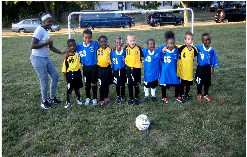
Akron Inner - City Soccer In House 5, 6, &amp; 7