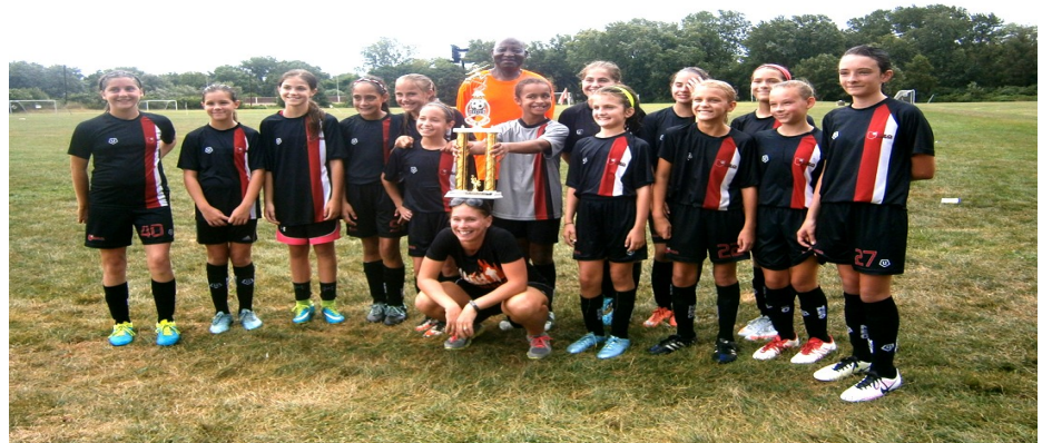
U-12 Girls, NEO Parma