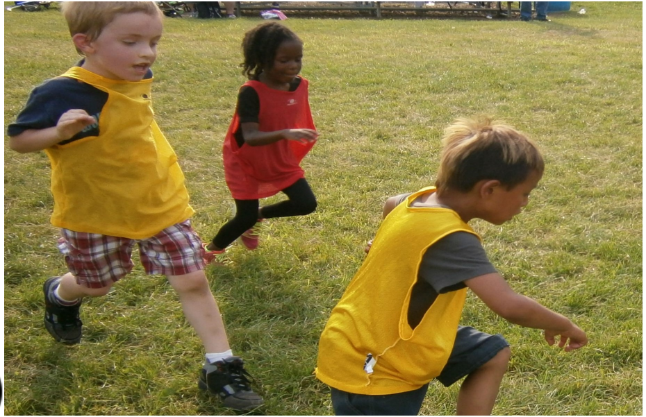
Akron Inner City Soccer - Spring Practice