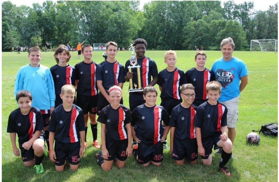
U-14 Boys, NEO Parma