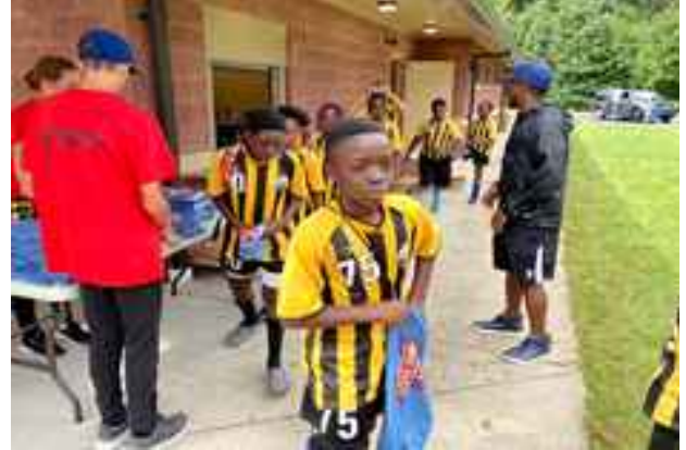
U13 Boys receiving their championship t-shirts after defeating Northwest in the Finals of Mike Good Memorial Tournament 2022.