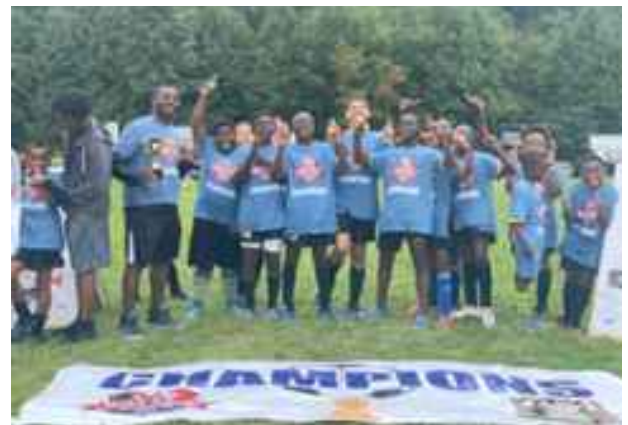
Mike Good Memorial Tournament Champions 2022 celebrating.